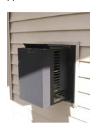
NO — This termination is retrofitted at the factory before installation.