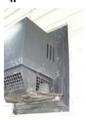
YES — A unit with this cap may require a retrofit, if not already done.