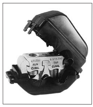
Compression connectors are available for aluminum only, copper only, or dualrated for copper and aluminum. Examples of typical connector markings are included in photo 4. Some compression connectors are pre-filled with antioxidant and some are not. When deciding whether to specify or install compres-

UL 486B allows aluminum connectors to be manufactured without this plating, but only for connectors rated for aluminum conductors only. Since the standard lug is dual-rated, it is plated with tin to prevent galvanic corrosion between the copper conductor and the aluminum connector.